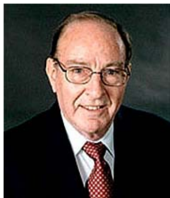
Capt. Edgar Mitchell, DSc

Presidential Medal of Freedom, the USN Distinguished Medal and three NASA Group Achievement Awards. Inducted to the Space Hall of Fame in 1979 and the Astronaut Hall of Fame in 1998. Recipient of honorary doctorates in engineering from New Mexico State University, the University of Akron, Carnegie Mellon University, and a ScD from Embry-Riddle University. Founder of the Institute of Noetic Sciences .