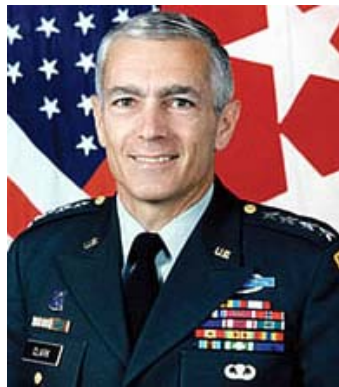
General Wesley Clark

Star, and Purple Heart for his service in Viet Nam and numerous subsequent medals and citations. Graduated valedictorian of his class at West Point.